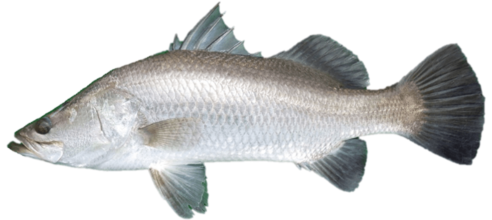
Ikan Kakap Putih