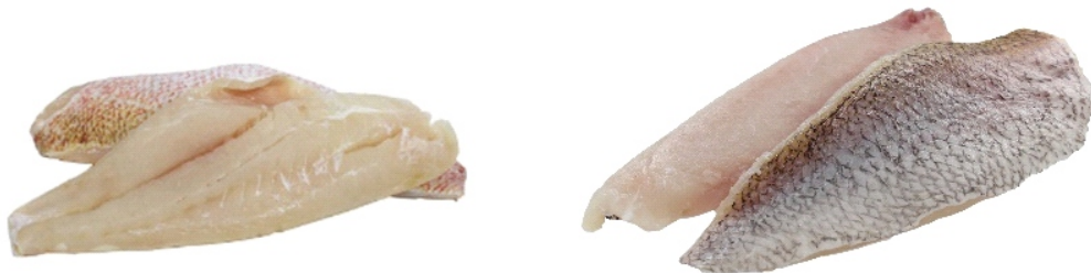
Ikan Kakap Anggoli