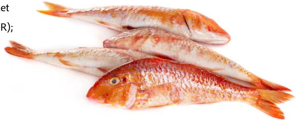
Ikan Belanak Merah