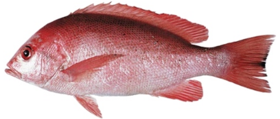
Ikan Kakap Merah